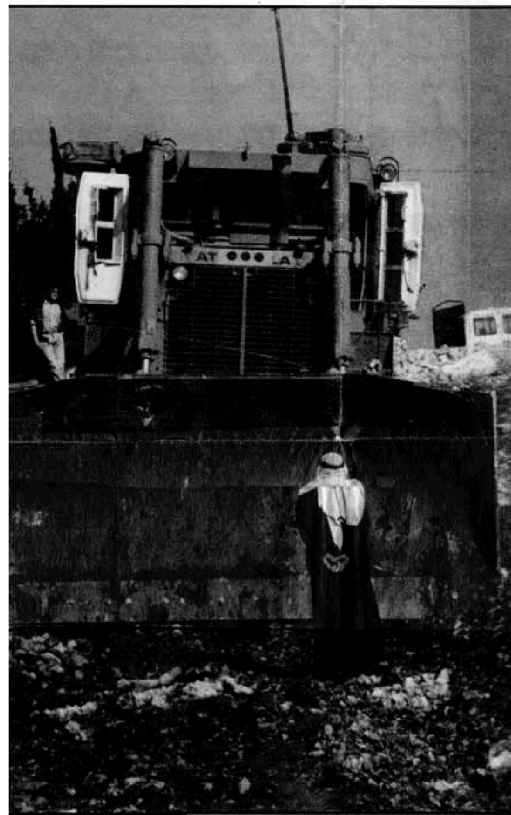
ary bulldozer brings the many gifts of civilisation to a primitive resident of Nablus in the West Bank.