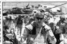
Harper and Livni enjoy military war games at CFB Trenton

Livni thanked Harper for Canada's many contributions to the civilisation of the West Bank. "The government of Canada's tax deductions were especially helpful in establishing 'Canada Park,'" she said. A beautiful verdant green family recreation area has replaced three ugly